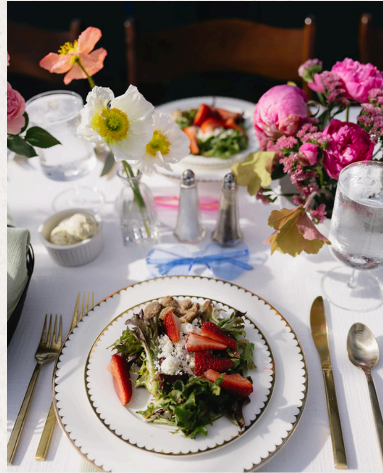
RECEPTION BANQUET TABLES